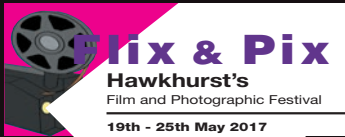
Photo Competition Entry Form, 2017

Hawkhurst's Film and Photographic and Arts Festival (19th - 25th May, 2017) including a Photographic Competition open to everyone in the Hawkhurst area, is organised by Kino Hawkhurst and Tesco Hawkhurst.